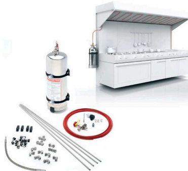
COMMERCIAL KITCHEN SYSTEMS