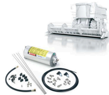
VEHICLE ENGINE SYSTEMS

FireDETEC® is designed and manufactured by the Rotarex Firetec division – the world leader in valves for the fixed installation and fire extinguisher market. Rotarex Firetec engineers invented the IHP and DIMES valve technologies used in the FireDETEC systems. Our products have been successfully proven in over 120 000 installations worldwide.