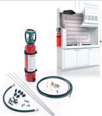
FUME CABINET SYSTEMS