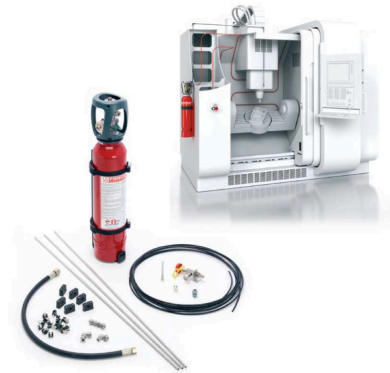
CNC MACHINE SYSTEMS