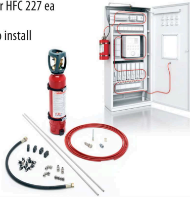
ELECTRICAL CABINET SYSTEMS